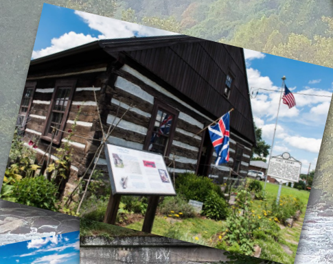
Ashby's Fort, Jennings Randolph Lake, Knobley Mountain Tunnel.