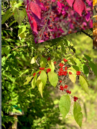
Images from the Arboretum at Larenim Park.